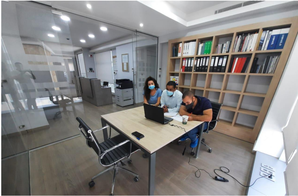
Trainers gave a brief about the awareness of mechanical design drawings and implementation on site